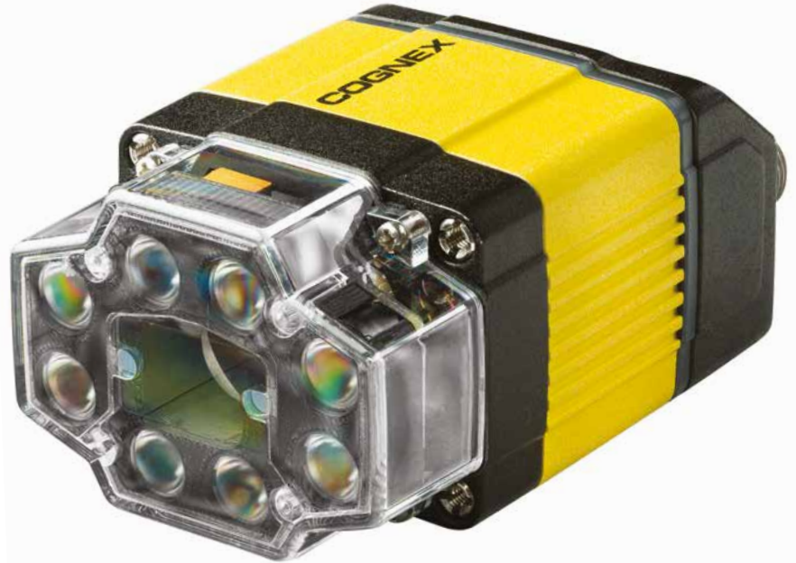
DataMan 360 series models offers a light-ring that provides 360 degree visual read indication and a Micro SD card for system-level backup and convenient unit restoration or replacement.

This next generation in the DataMan 300 series includes intelligent image buffering to provide performance feedback that is critical to fixing process issues and increased image storage. The DataMan 360 also offers a 360 degree visual read indicator and a Micro SD card for system-level backup and convenient unit restoration or replacement.