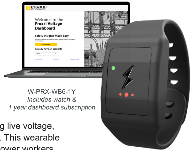
W-PRX-WB6-1Y Includes watch & 1 year dashboard subscription

Proxxi by Grace provides real-time alerts to workers approaching live voltage, adding an extra layer of security for when the unexpected occurs. This wearable voltage-detecting wristband, companion app and dashboard empower workers and management with actionable data to prevent injuries and fatalities, enhancing overall safety and productivity.