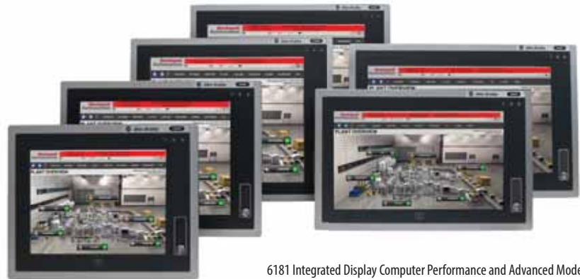
6181 Integrated Display Computer Performance and Advanced Models

The Allen-Bradley® 6181 Integrated Display Computers form a dynamic portfolio, with Standard, Performance and Advanced Models that provide all-in-one industrial PC options to help meet your application needs. While the Standard models maintain their original characteristics, the latest generation Performance models build upon the trusted Series E 6181 Integrated Display Computer platform to help provide you with an enhanced user experience and exceptional processing power.