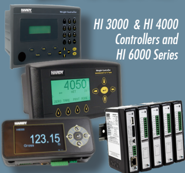
HI 3000 & HI 4000 Controllers and HI 6000 Series