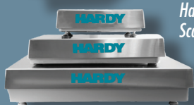
Hardy Bench Scales