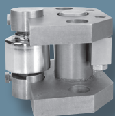
ADVANTAGE Series Load Point with C2 Calibration

Hardy carries a wide variety of strain gauge load points and scale bases to accommodate your application requirements.