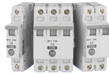
Circuit Breakers/ Fuses