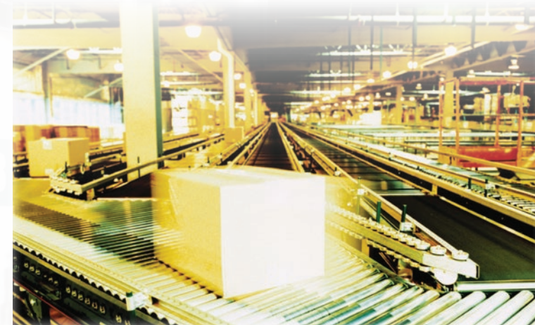
Sample application of conveying equipment in a material handling process.

ArmorBlock I/O and ArmorBlock Guard I/O blocks are best-suited for automotive, material handling and packaging applications.