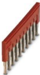
Plug-in bridge, pitch: 6.2 mm, width: 60.3 mm, number of positions: 10, color: red

Please be informed that the data shown in this PDF Document is generated from our Online Catalog. Please find the complete data in the user's documentation. Our General Terms of Use for Downloads are valid ( http://phoenixcontact.com/download )