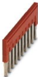
Plug-in bridge, pitch: 5.2 mm, length: 22.7 mm, width: 50.6 mm, number of positions: 10, color: red

Please be informed that the data shown in this PDF Document is generated from our Online Catalog. Please find the complete data in the user's documentation. Our General Terms of Use for Downloads are valid ( http://phoenixcontact.com/download )