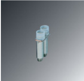
Fixed bridge, pitch: 5 mm, number of positions: 2, color: silver

Please be informed that the data shown in this PDF Document is generated from our Online Catalog. Please find the complete data in the user's documentation. Our General Terms of Use for Downloads are valid ( http://phoenixcontact.com/download )