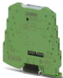
MCR temperature transducer for Pt 100 temperature sensors, configured via DIP switch, with screw connection, not pre-configured

Please be informed that the data shown in this PDF Document is generated from our Online Catalog. Please find the complete data in the user's documentation. Our General Terms of Use for Downloads are valid ( http://phoenixcontact.com/download )