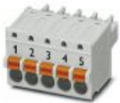
PCB connector, nominal cross section: 1.5 mm 2 , color: light gray, nominal current: 8 A, rated voltage (III/2): 160 V, contact surface: Tin, type of contact: Female connector, Number of potentials: 5, Number of rows: 1, Number of positions per row: 5, number of connections: 5, product range: FK-MCP 1,5/..-ST, pitch: 3.81 mm, connection method: Push-in spring connection, conductor/PCB connection direction: 0 °, plug-in system: MINI COMBICON, Locking: without, type of packaging: packed in cardboard

Printed-circuit board connector - FK-MCP 1,5/ 5-ST-3,81GY35BD1-5 - 1015782