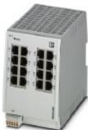
Managed Switch 2000, 16 RJ45 ports 10/100/1000 Mbps, degree of protection: IP20, PROFINET Conformance-Class A

Please be informed that the data shown in this PDF Document is generated from our Online Catalog. Please find the complete data in the user's documentation. Our General Terms of Use for Downloads are valid ( http://phoenixcontact.com/download )