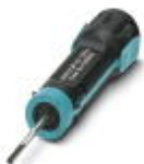
Assembly tool, for CK 1.6... crimp contacts for small conductor cross sections

Assembly tool - UNIFOX MT-CK 1.6/2.5 - 1089092