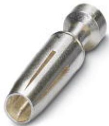
Turned 2.5 crimp contact, individual female contact, core diameter 0.5 mm 2 , silver-plated

Please be informed that the data shown in this PDF Document is generated from our Online Catalog. Please find the complete data in the user's documentation. Our General Terms of Use for Downloads are valid ( http://phoenixcontact.com/download )