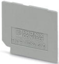
End cover, length: 24.5 mm, width: 1 mm, height: 20.9 mm, color: gray

Please be informed that the data shown in this PDF Document is generated from our Online Catalog. Please find the complete data in the user's documentation. Our General Terms of Use for Downloads are valid ( http://phoenixcontact.com/download )