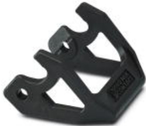
Double locking latch for B10 / B16 / B24 housing, HC-EVO....AL and HC-STA....AL

Please be informed that the data shown in this PDF Document is generated from our Online Catalog. Please find the complete data in the user's documentation. Our General Terms of Use for Downloads are valid ( http://phoenixcontact.com/download )