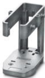
HEAVYCON DIN rail mounting frame, lower part for double locking latch, for sleeve housing with double locking latch or HC-CIF..HFFD.., for type B16 contact inserts, for NS35/7,5 DIN rails

Please be informed that the data shown in this PDF Document is generated from our Online Catalog. Please find the complete data in the user's documentation. Our General Terms of Use for Downloads are valid ( http://phoenixcontact.com/download )