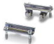
Adapter insert, type: D15

Adapter insert - HC-CIF-D15-AIWS-SM-NI - 1424340