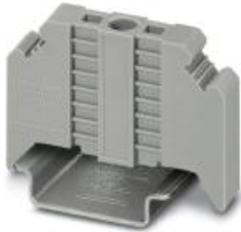
End clamp, width: 9.5 mm, color: gray

Please be informed that the data shown in this PDF Document is generated from our Online Catalog. Please find the complete data in the user's documentation. Our General Terms of Use for Downloads are valid ( http://phoenixcontact.com/download )