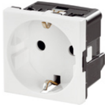
Power - sockets

FrontCom® Vario integrates multiple functions in only one single frame. The system is easy to install and you can select from a wide range of data, signal and power modules. In addition to being extremely compact, FrontCom® Vario offers a number of unique product features that will make your project planning and work activities secure, fast and future-proof. Furthermore, the FrontCom® Vario system has an attractive housing design that, by the way, offers highest impact-resistance and fully meets the requirements of IP 65 protection class.