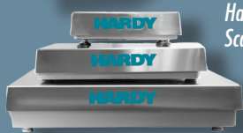
Hardy Bench Scales