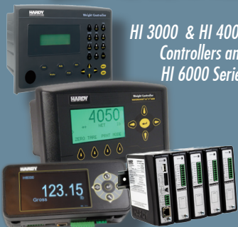
HI 3000 & HI 4000 Controllers and HI 6000 Series