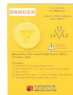
Part Number: R-T3 with label (label sold separately)

Part numbers include: R-1A003-LPH and R-T3