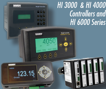
HI 3000 & HI 4000 Controllers and HI 6000 Series