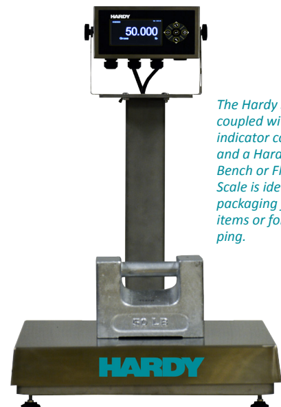
The Hardy SME coupled with an indicator column and a Hardy Bench or Floor Scale is ideal for packaging food items or for shipping.

Each instrument consumes just 5 watts nominal and 8 watts max, saving energy costs while driving up to 8 load points.