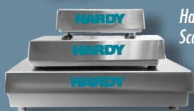
Hardy Bench Scales